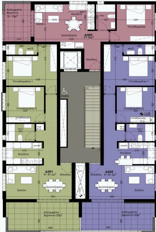
Κάτοψη 2ου ορόφου