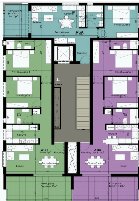
Κάτοψη 1ου ορόφου