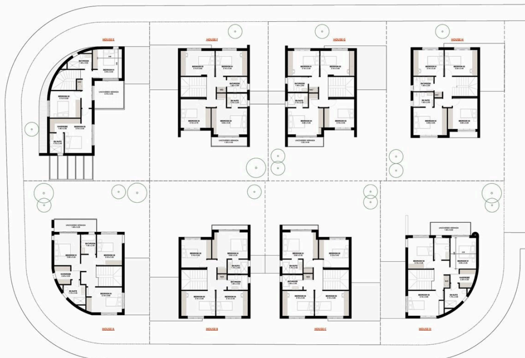
FLOOR PLAN NOT TO SCALE